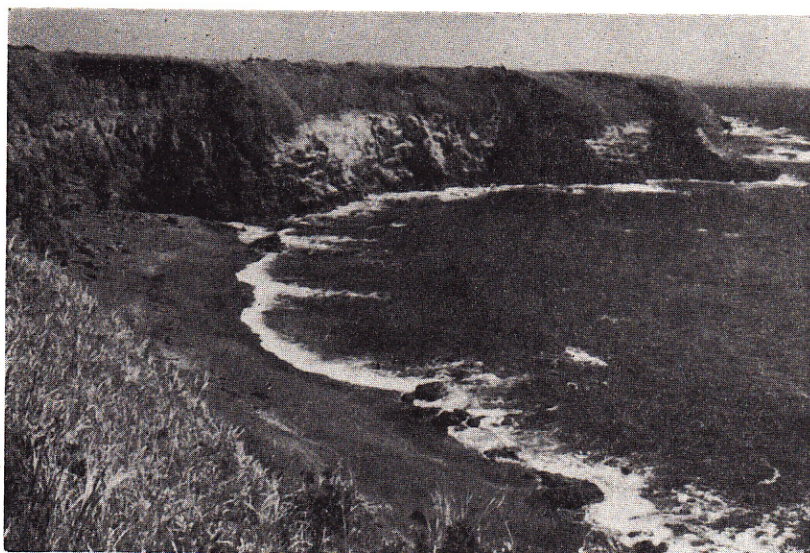
Habitat of Demigretta sacra ringeri STJNEGR. Jogashima, Misaki.